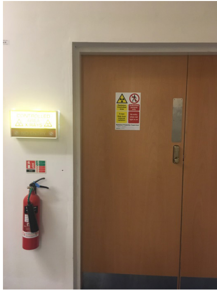
This is the door to the cone beam CT room