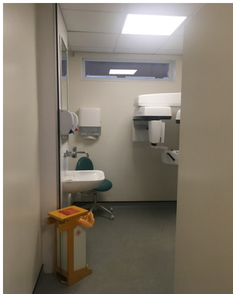
This is what you will see when you walk in the room