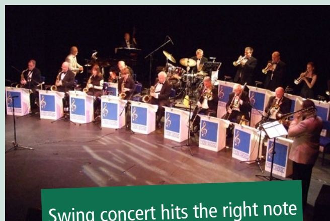
Swing concert hits the right note