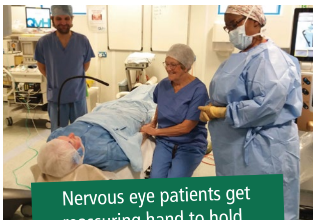
Nervous eye patients get reassuring hand to hold

Recently, a fear-busting scheme to help patients who are nervous about having eye operations was launched at the hospital.