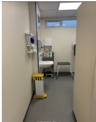
This is what you will see when you walk in the room