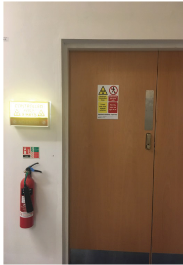
This is the door to the cone beam CT room

You will then be asked to sit in the waiting room. If you want to sit somewhere else, you can ask at reception and they will direct you to somewhere more suitable for you